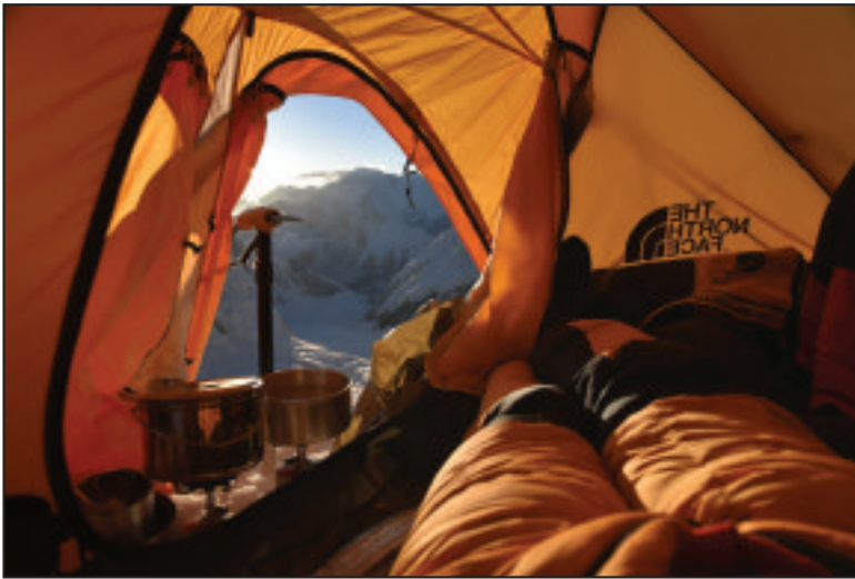
The view from Camp 3 out the front of the tent.